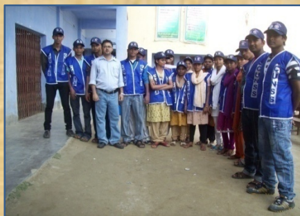
NSS students with the faculty