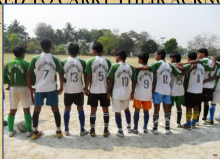
College Football Team