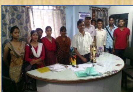
NCC team with Principal & faculty