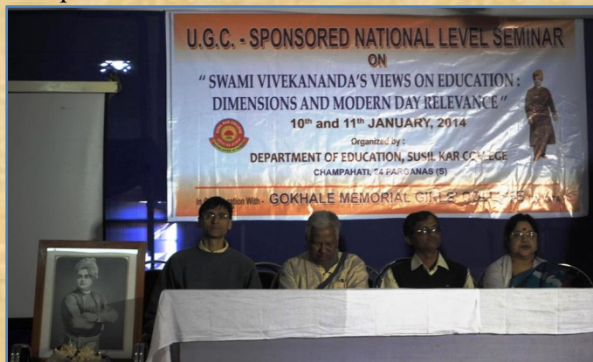
National Seminar organized by Education Dept.