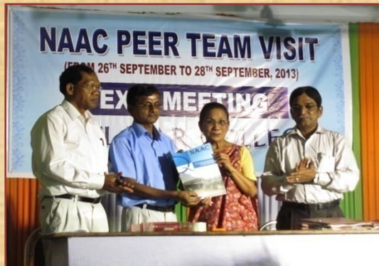
Visit of NAAC Peer Team

UNIVERSITY OF CALCUTTA Academic Calendar for the B.A./ B.Sc./B.Com. Courses of Studies (under 1+1+1 System of Examinations) for the Academic Session 2018-2019