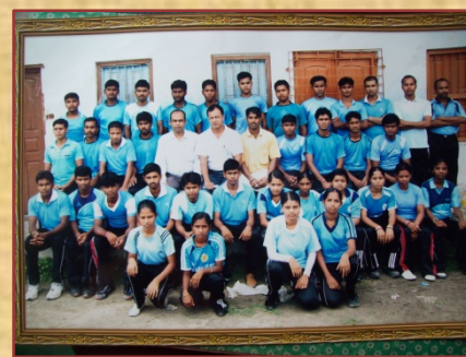
Physical Education Students With Faculty