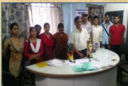
NCC team with Principal & faculty