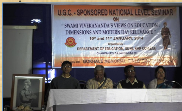
National Seminar organized by Education Dept.